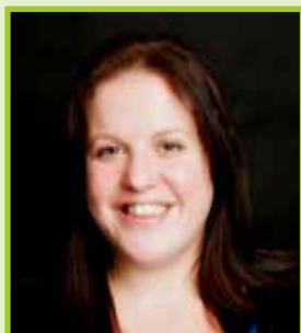
Hannah Cecil Joan Gordon Memorial Award