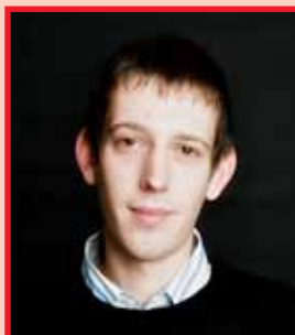
Harry Sivyver College Award